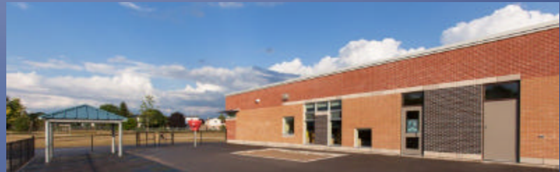
Kindergarten Play Yard

Full-day kindergarten classrooms have secondary egress, coat and cubby areas, and a private washroom incorporated into the design. These are standards that have been implemented to accommodate new government mandates to offer full-day kindergarten programs to the community.