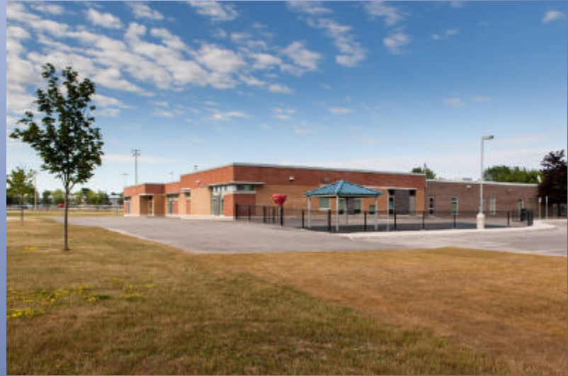
Kindergarten Play Yard

The new classrooms along the perimeter of the East facing addition have windows that are located lower than typical classroom windows to embrace the indoor-outdoor connection of the learners and faculty. One of the many sustainability initiatives implemented was the use of sun shades at the top of the exterior windows to block some of the intense, high summer sun. Environmentally conscious finish materials such as flooring, laminate and paint finishes have been selected to further contribute to sustainability considerations.