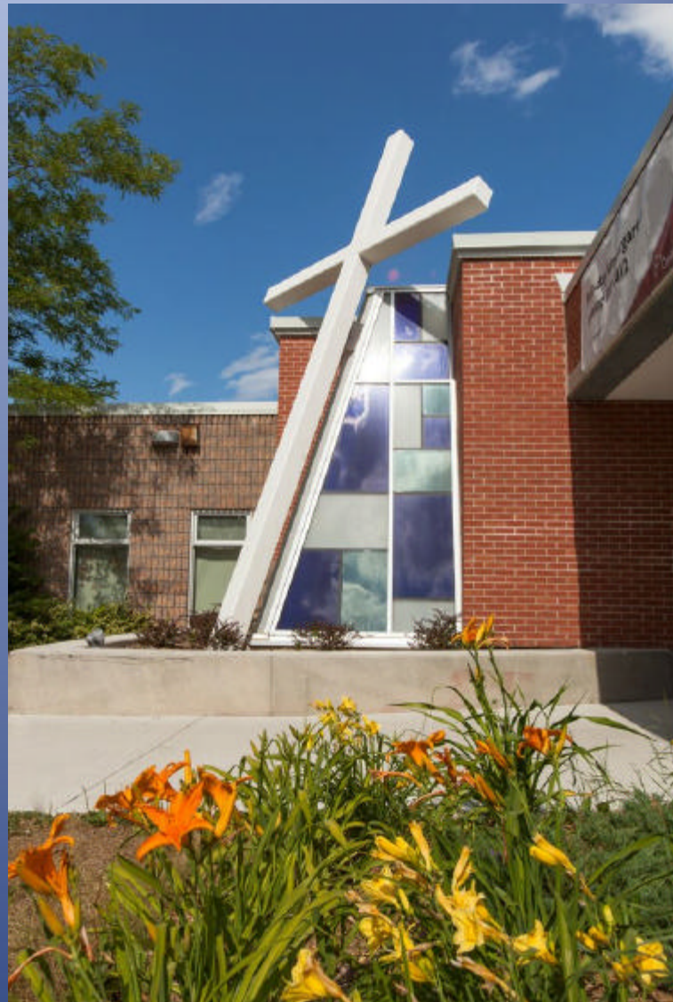
View of Front Entrance at Chapel