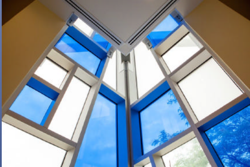
Interior Detail of Stain Glass at Chapel

The main feature of this project was the addition of a new chapel. The light, translucent stained glass crystal-like corner of the Chapel appears to bear the weight of a heavy precast concrete cross. The overbearing juxtaposition is a deliberate attempt at catching the attention of approaching visitors or passers-by, to create a tension that the visitor interacts with as the cross angles away appearing to be supported by the fragile, glass façade.