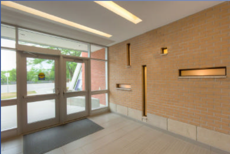
Interior of New Main Entrance

To achieve the goal of creating a high performance 'green' school for the Simcoe County District School Board, the holistic design approach was taken – a process that was inclusive, multi-disciplinary and consensus-building, where all participants had to think in terms of ' systems '!