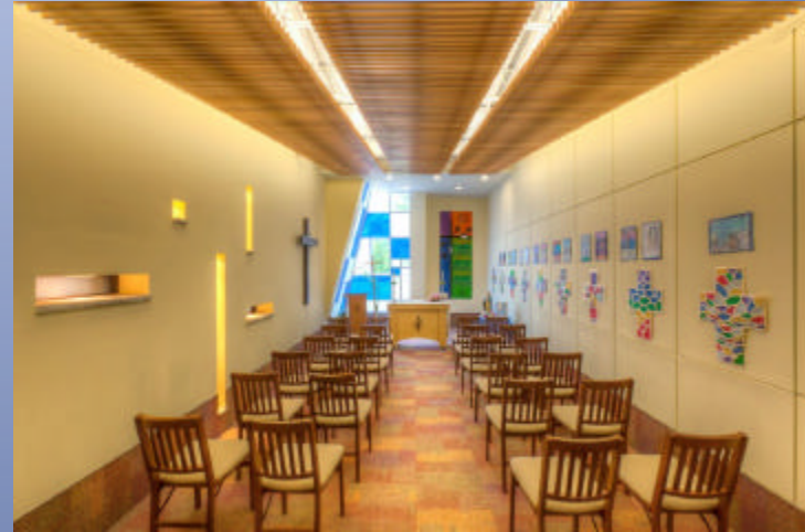
Interior of Chapel

This holistic view extended to the entire project team through the 'integrated design process' and included client/stakeholders by way of project managers, project coordinators, the chief custodian and plant staff, Kingsland? Architects Inc. and their engineering and landscape consultants, specialists and authorities having jurisdiction. The core team, which included the client, the architects, the structural, electrical and mechanical consultants, the civil and landscape consultants, and the general contractor, maintained the continuity of the design through all stages of the project, from concept through to final completion and occupancy, with other participants involved at the appropriate stages.