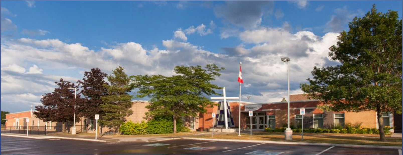
Main Exterior Image