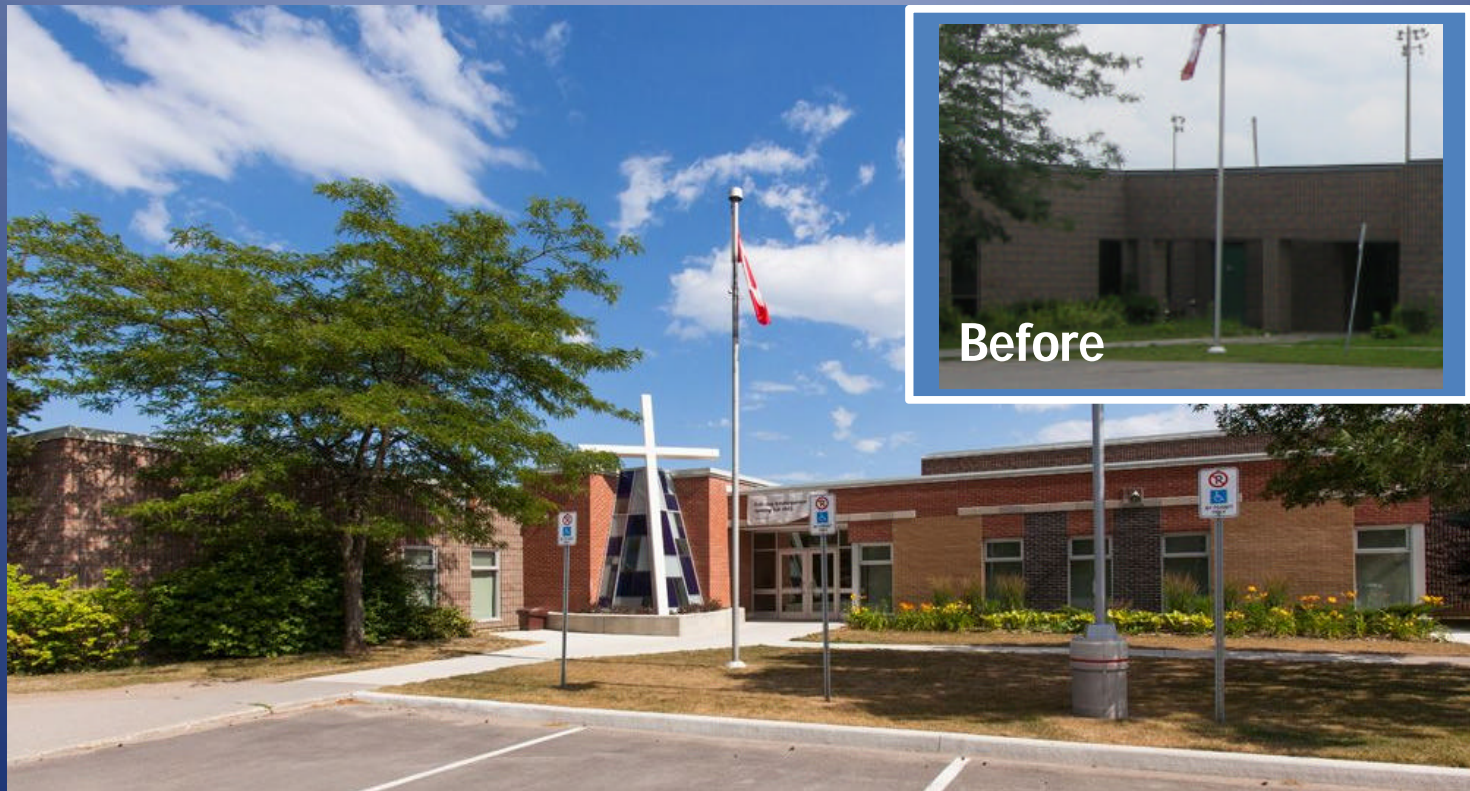
Main Entrance for Father F.X. O'Reilly