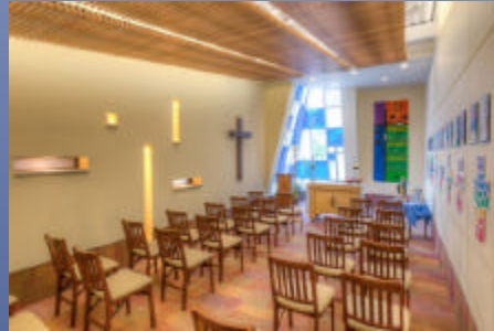
Inside of Chapel