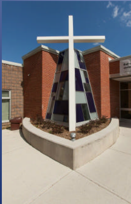
Chapel at Entrance

The major addition to Father F. X. O'Reilly Catholic School incorporates two new full-day kindergarten classrooms complete with a new exterior kindergarten play area, six regular classrooms with natural light filtering within, as well as, a new custodial office and storage space to promote positive learning and working experiences by bringing the learning environment together under one roof. As a result daily activities are now executed with efficiency, functionality and practicality. The East wing addition to the building represents a strengthened sense of community, promotes healthy and open communication, and builds on the schools wonderful dedication to academic excellence, which in turn nurtures the development of the whole student and the joy of learning, is enhanced.