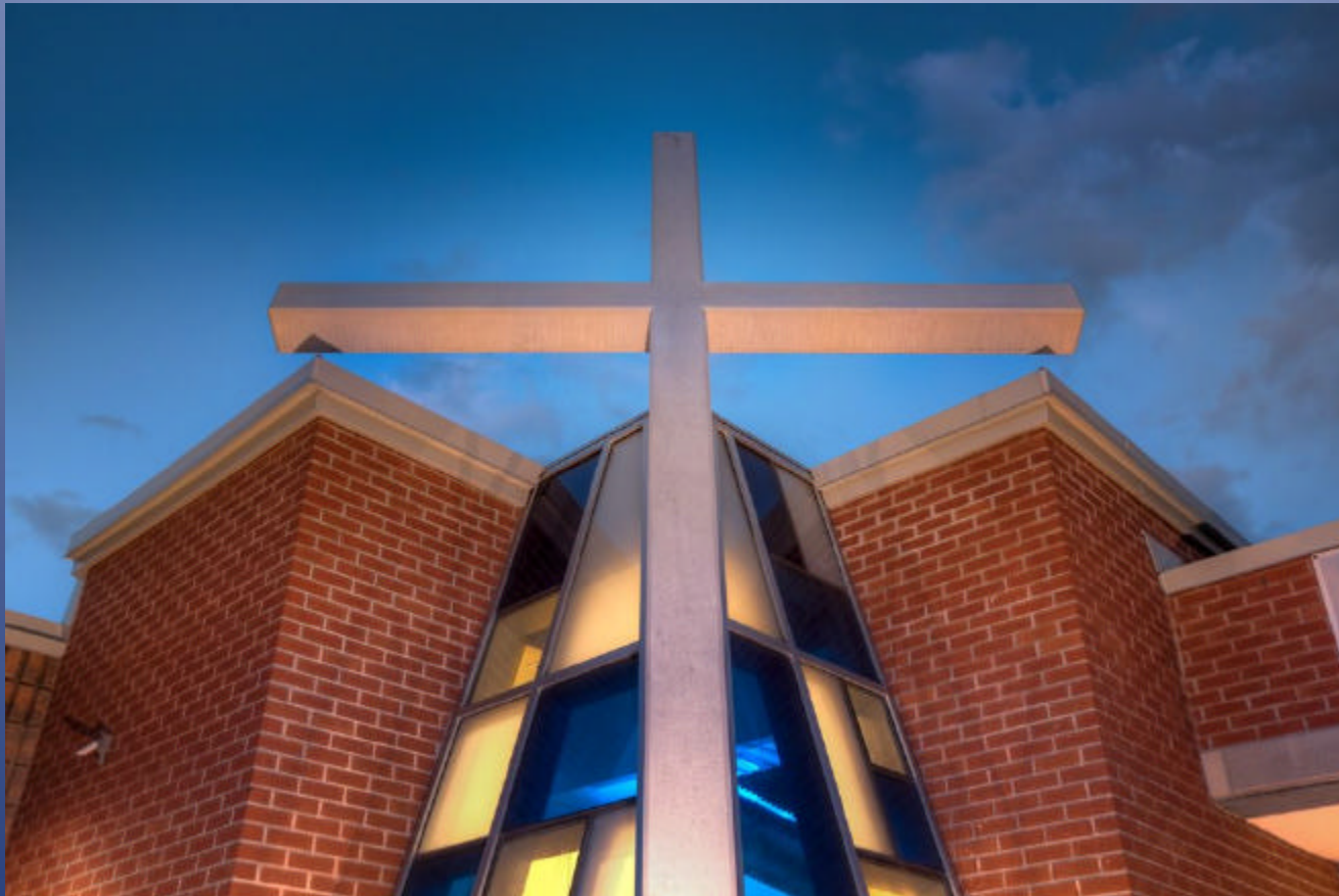
Crucifix Detail at Dusk