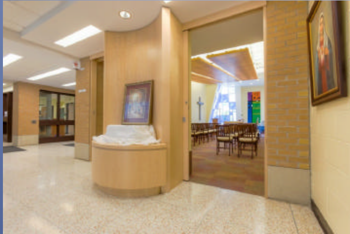
Main Lobby looking at Chapel