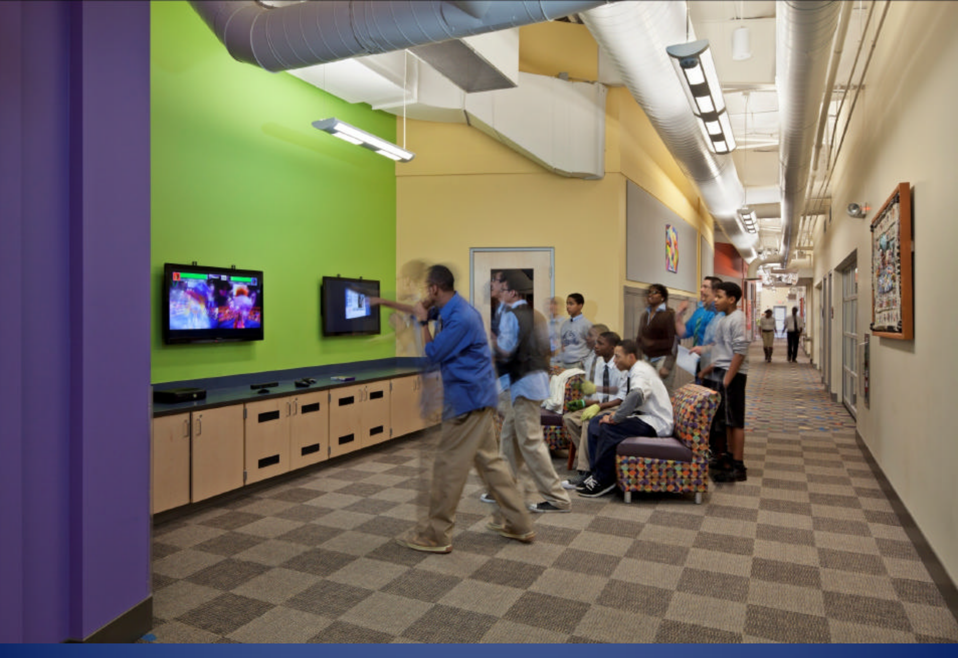
Gaming is used as a learning tool to support differentiated instruction for kinesthetic learners