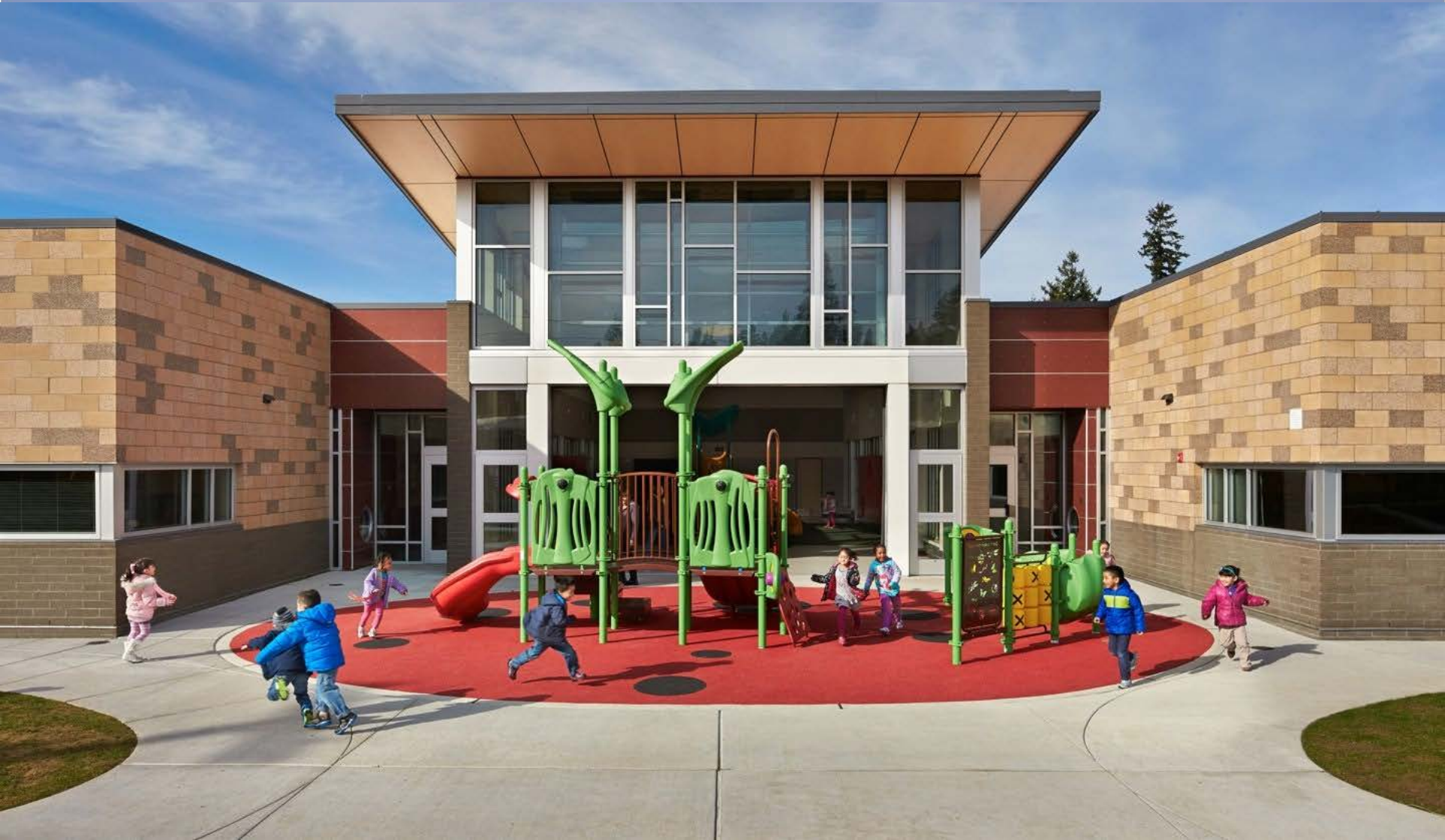
PHOTO: Each classroom wing opens via glass garage door onto an exterior shared play court.