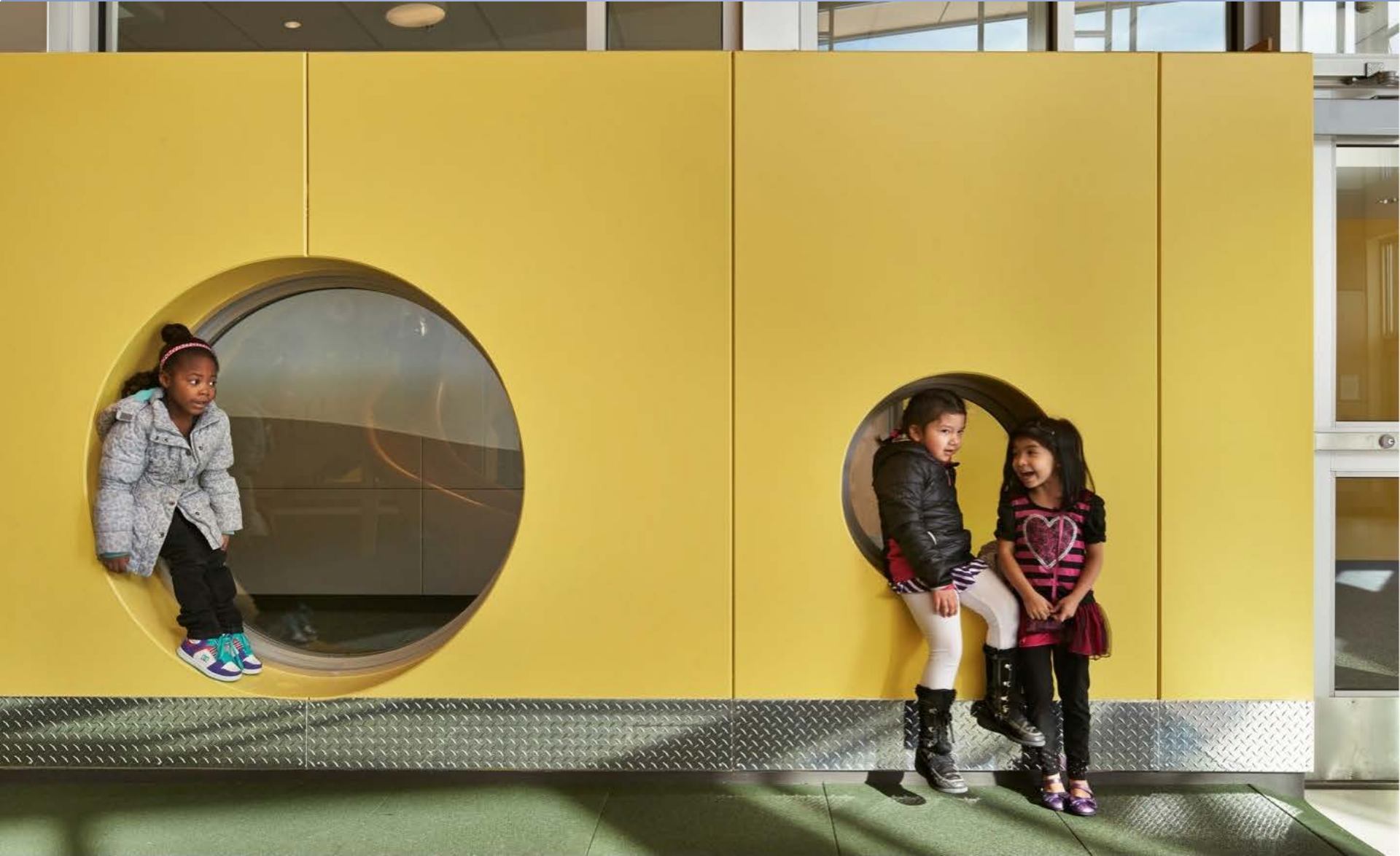
PHOTO: Whimsical windows preserve transparency & supervision, while providing an imaginative play environment.